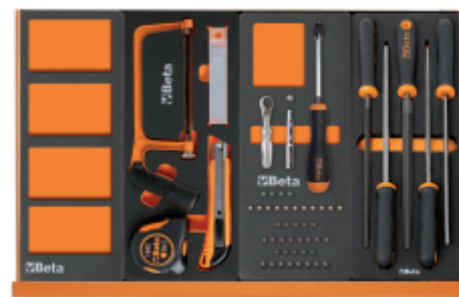
VPM3 M294 M85 M236