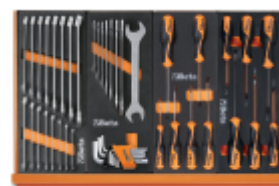
M05 M33 M204 M201