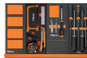
VPM3 M294 M85 M236