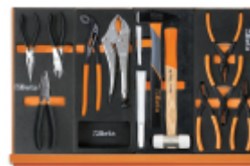
M137 M153 M237 M145